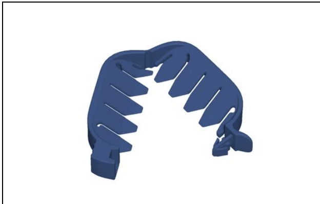
1305-017 – Beef Clip Metal Detectable